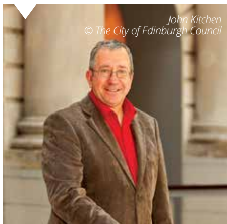
John Kitchen © The City of Edinburgh Council